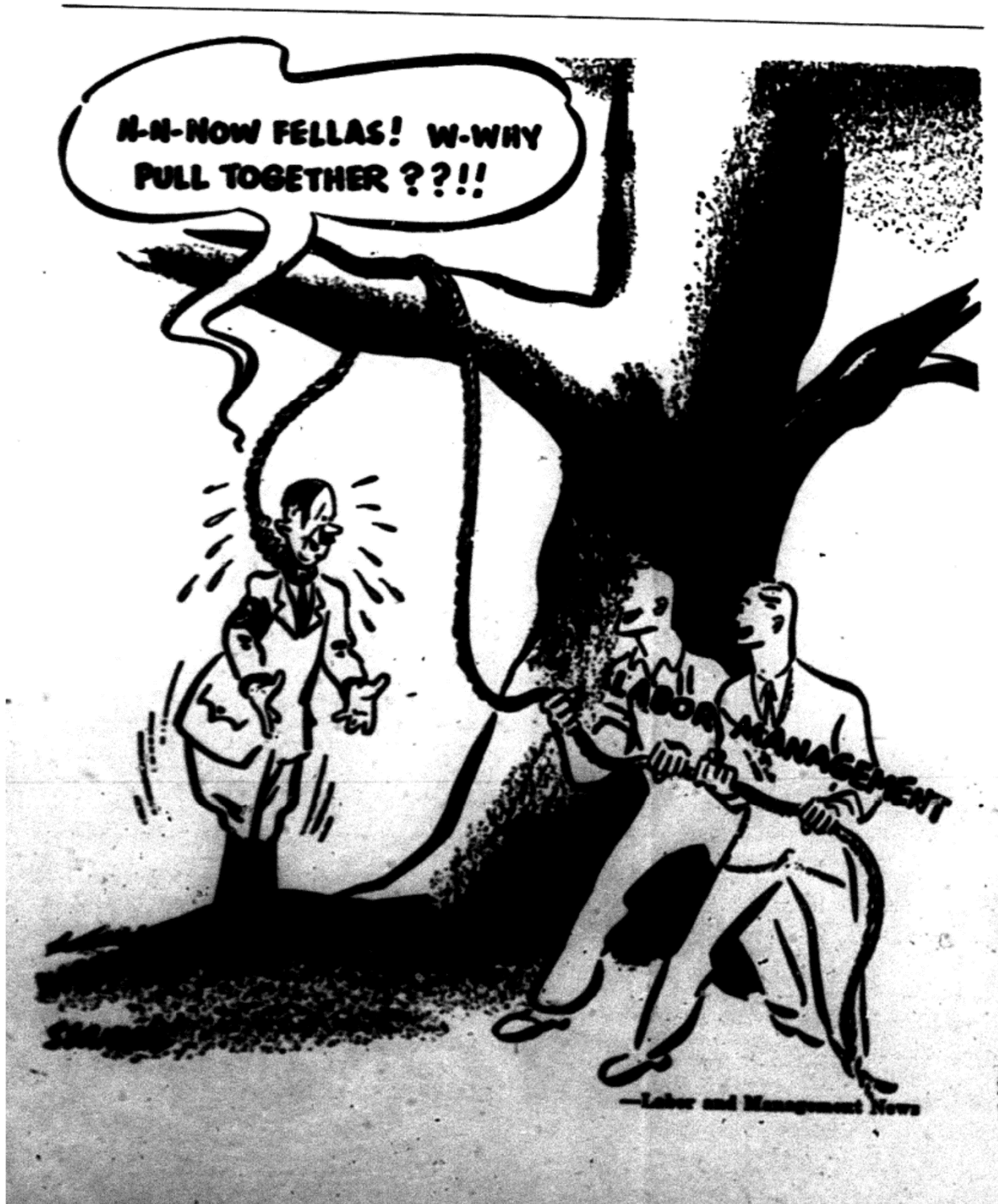
Figure 1. Labor and Management Cartoon, Navy Yard Salute (Bremerton), July 14, 1944, Suzzallo and Allen Libraries Special Collections, University of Washington, Seattle, WA, microfilm, p. 2.