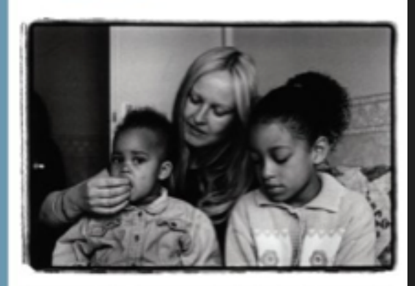
INTERRACIAL INTIMACY AND RACIAL LITERACY